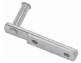
252-A Striker S252AXXXZNXX