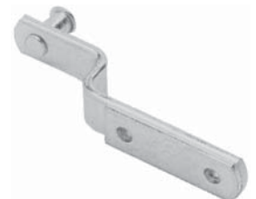
252-B Striker S252BXXXXZNXX